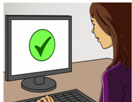
Alice has received the signed project proposal the same day and can initiate the project.