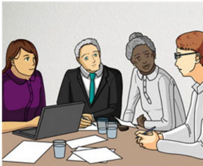
Alice has an initial project meeting with managers and team leaders

Please also see the developer mode for this tutorial here: Visit the developer mode .