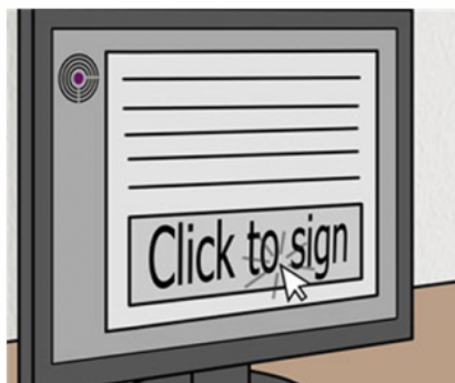
She reads the project proposal and signs it directly on the computer via Click2Sign.