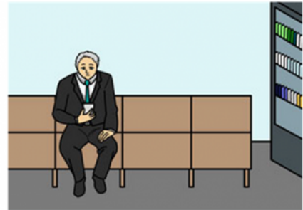
Bob, a team leader, is on the way to a customer and checks his emails while waiting on the train. He opens the project proposal from Alice.