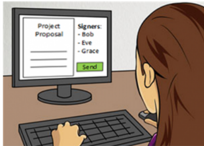
Alice has finished the project proposal and sends it for signing via the company's project management software, with integrated eSAW.